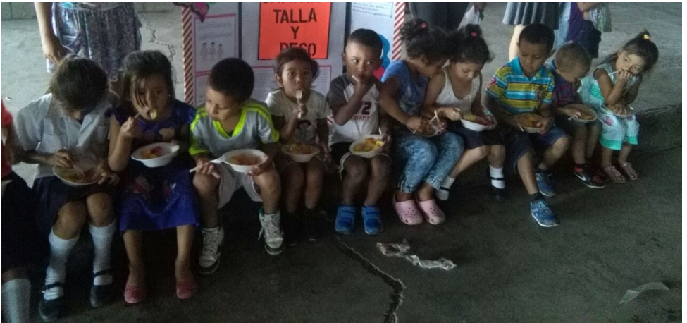
Feeding Programme, Honduras

‘Live more simply that others may simply live’