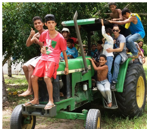
Some of our boys enjoying a day on the farm

After each boy is deemed by our welfare authorities' ready to leave and return to some form of family or relatives home, we continue to supervise