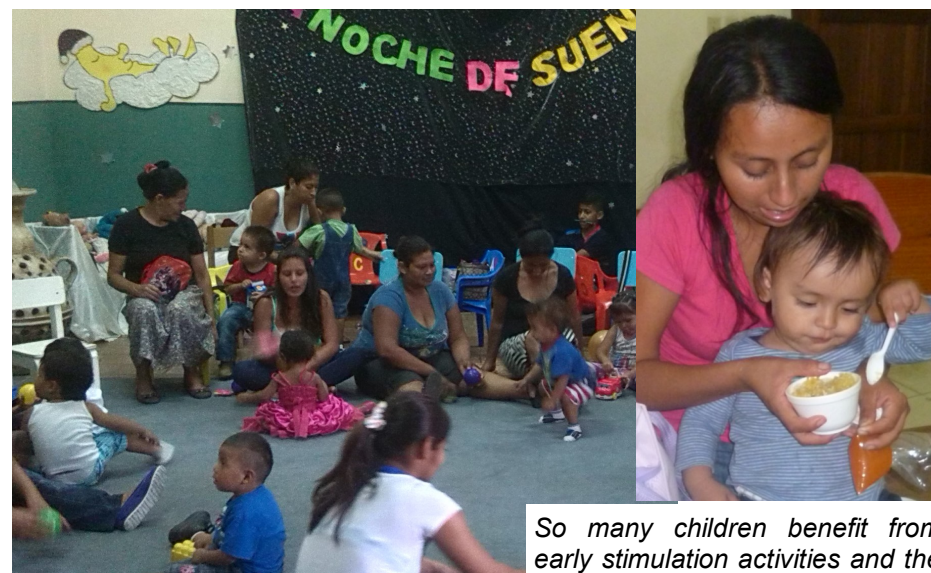
So many children benefit from early stimulation activities and the childhood nutrition programme

The most recent activity is one of early childhood stimulation and we can report that the nutritional deficiencies found are quite prominent, thus justifying investments in nutritional supplementation and feeding activities. We are very proud to have shared a strategic alliance with Caring and Sharing during many of these years. Our desire is that given the needs we encounter this relationship will continue for many years into the future