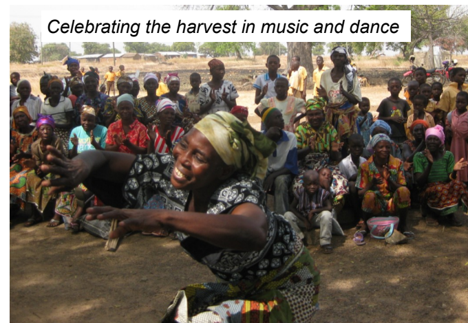
Celebrating the harvest in music and dance

The impact of climate change in northern Ghana results in severe drought in the dry season alongside high temperatures, influx of pest and disease. Flooding has often rendered people homeless and caused loss to agricultural products and property – all these ultimately resulting in famine and lack of drinking water because the usual supplies have often been contaminated. Small scale farmers, particularly women in northern Ghana, are hardest hit as they constantly face displacement from their farms, and loss of livestock to perennial flood waters.